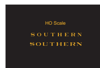
SR DWG SL-1050